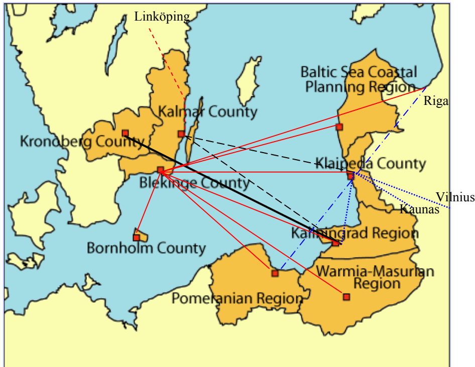
Fig 2 The Science Parks own Networking